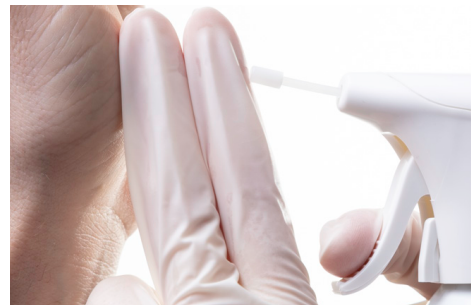
2-3 centimetres from the condyloma

3. Spray at a distance of 2-3 centimetres from the condyloma, for up to 6 seconds. A film of white ice crystals will now form in the treated area. After (up to) 30 seconds, the ice crystals are no longer white, indicating that the thawing period has ended. The first freeze-thaw cycle is now completed.